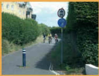
campaigning for ...