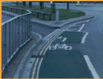
new cycle routes