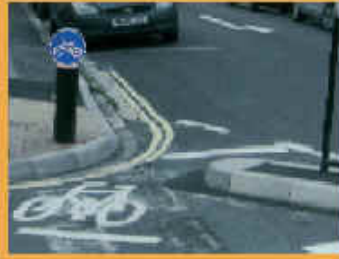
... new solutions