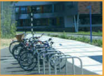
... safer cycling